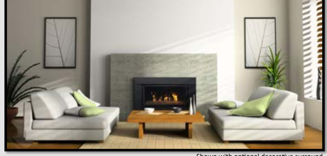
Shown with optional decorative surround