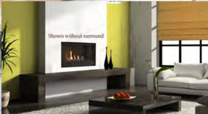
Shown without surround